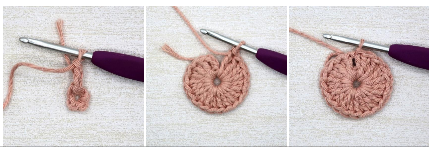
Round 2: ch1, turn the work, working on the wrong side, 1sc into the sl st made from joining prev rnd, then 1sc into each of the next 19sts (Make sure you have 20sts – don't worry if it seems like there is an empty stitch at the end of the round); join with a sl st into the 1st sc made. (20sts)