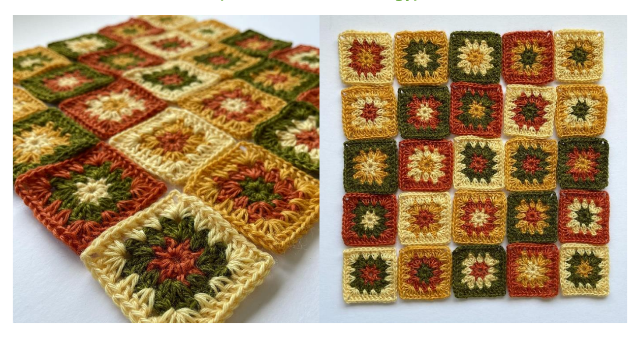
A crochet pattern by Merrian Holland